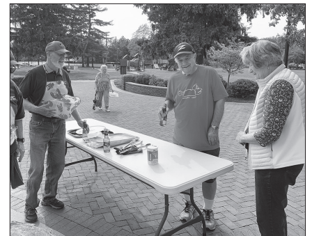
Boiling lobster is hard work

The COVID situation contributed to several cancellations. Costs for the rental as well as for the lobsters increased since 2019. We hope many more AUAR members will be able to join us on May 19, 2023.